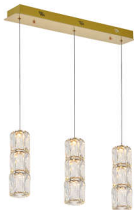
Gold Item No:3500D3G